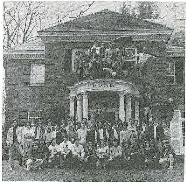
The brothers and their guests celebrate Dartmouth's victory over Brown with a pre-game punch party.

The brothers are once again very active in other campus organizations. Kappas hold top positions in The Dartmouth , WDCR-WFRD, the Outing Club, the Marching Band, the Glee Club, and many other groups. A '79 pledge, Steve Levitan '82, was responsible for starting a new, well-acclaimed magazine, Campus . Many