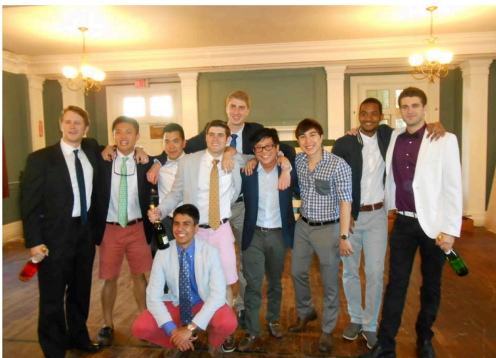
Some of our '14s before our Spring Formal