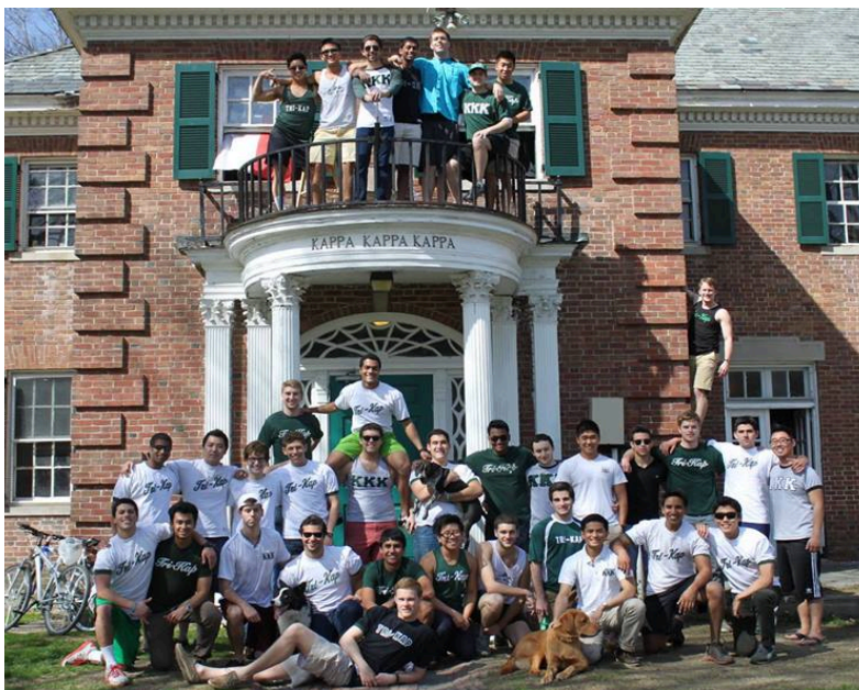
The Tri-Kap yearbook photo from the spring with most spring term brothers present