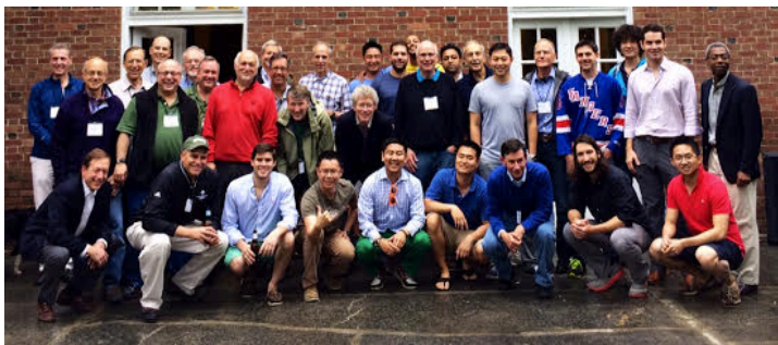
Alumni at reunions in June