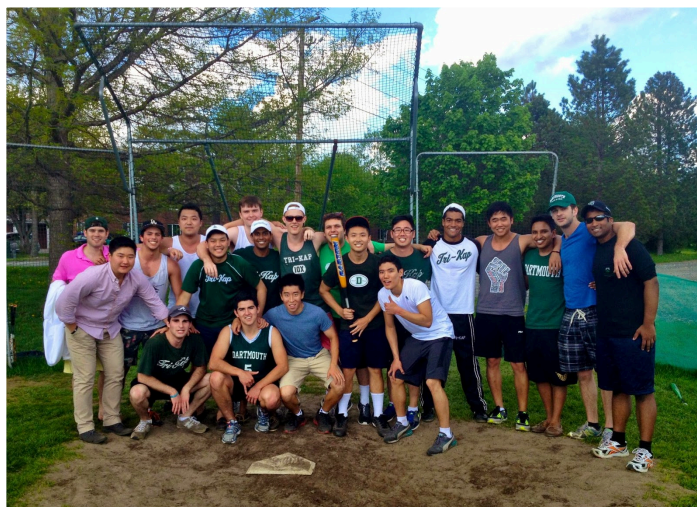
The intramural softball championship team (and accompanying hecklers)