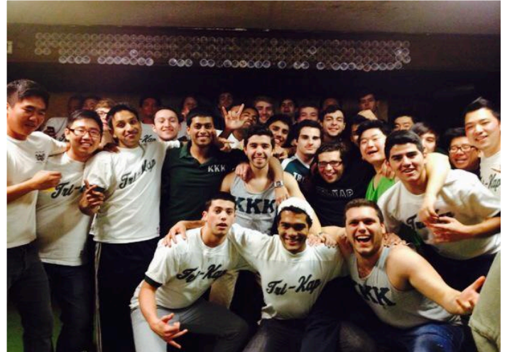
The brotherhood following Wednesday meetings